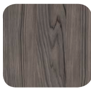
◆ *Smoked Cedar TM