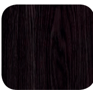
◆ *Burnt Oak