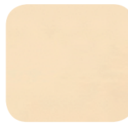
◆ Medium Cream