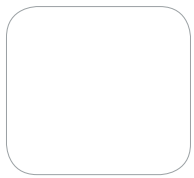
◆ *Pure White