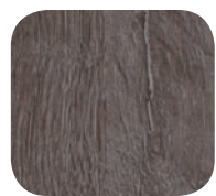
◆ Aged Stone