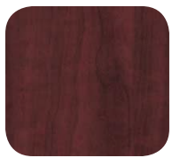
*Royal Mahogany TM