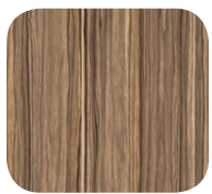
*Indian Ebony TM